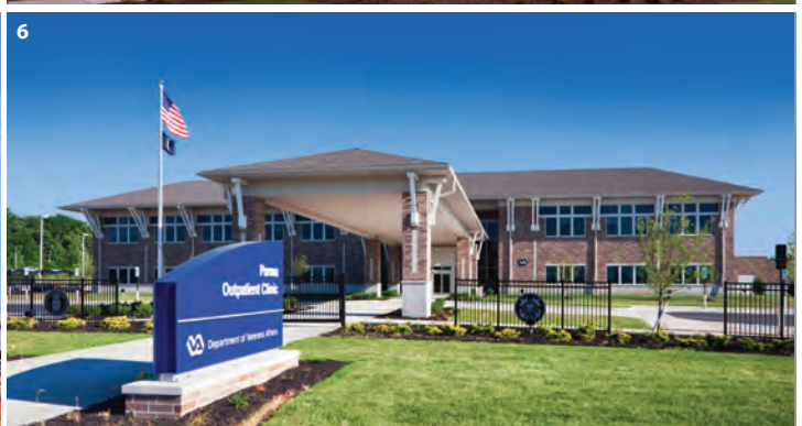
1 Arista - Chandler, AZ 2 San Juan Passage - Anacortes, WA 3 30 East - Chicago, IL 4 College Town - Rochester, NY 5 Delta Towers - Washington, DC 6 Department of Veterans Affairs Outpatient Clinic - Parma, OH