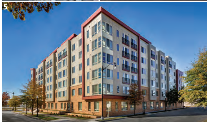
1 Sea Park Apartments - Brooklyn, NY 2 Twin Parks West (Rental Assistance Demonstration) - The Bronx, NY 3 The Peninsula - The Bronx, NY 4 Todd A. Lee Senior Residences at Kennedy Street - Washington, DC 5 The Grove at Parkside - Washington, DC

10,000+ affordable / mixed-income units developed/underway in 9 cities