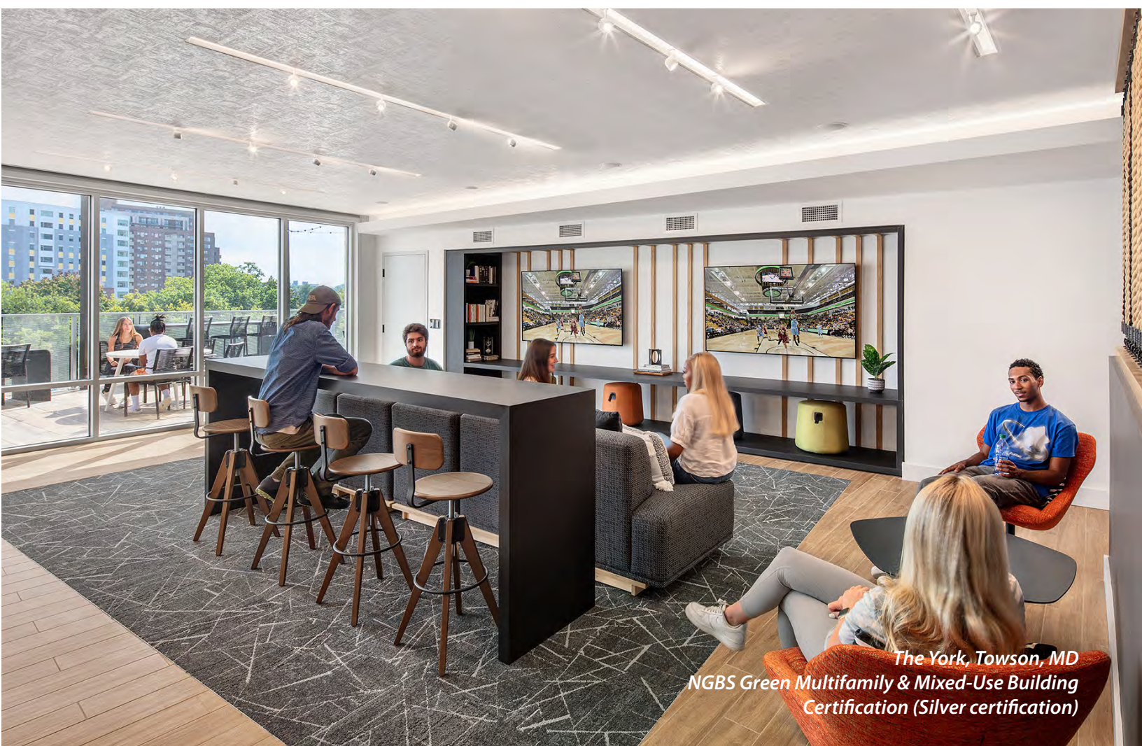
The York, Towson, MD NGBS Green Multifamily & Mixed-Use Building Certification (Silver certification)