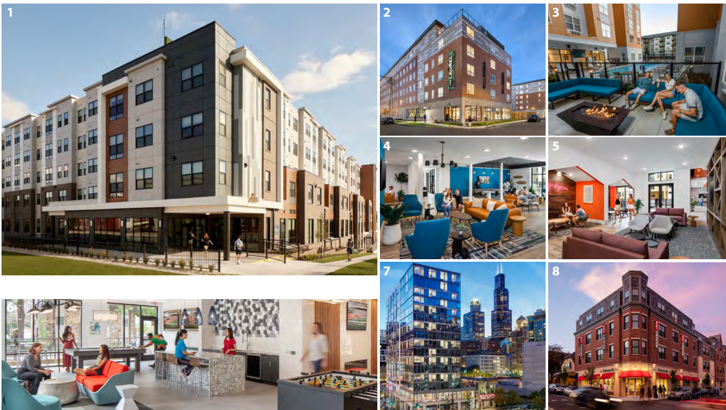
1 The Hive - Iowa City, IA 2 The Laurel - Syracuse, NY 3 Sierra - Corvallis, OR 4 The Current - Pomona, CA 5 Bixby on College - Clemson, SC 6 Octave - Champaign, IL 7 30 East - Chicago, IL 8 257 Thayer - Providence, RI