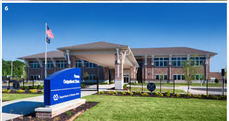
1 Arista - Chandler, AZ 2 San Juan Passage - Anacortes, WA 3 The Laurel - Syracuse, NY 4 College Town - Rochester, NY 5 Delta Towers - Washington, DC 6 Department of Veterans Affairs Outpatient Clinic - Parma, OH