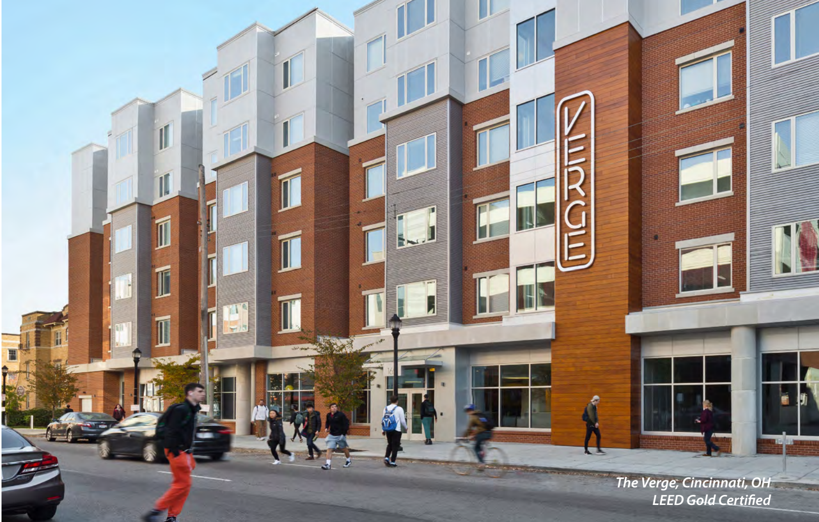
The Verge, Cincinnati, OH LEED Gold Certified