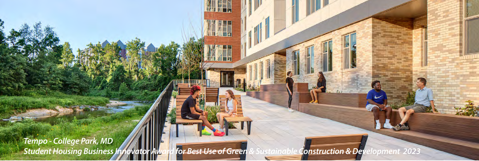
Tempo - College Park, MD

Student Housing Business Innovator Award for Best Use of Green & Sustainable Construction & Development 2023